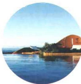
Kenya's Sanctuary at Ol Lentille

“The Sanctuary at Ol Lentille doesn't just avoid harming the environment, it actually improves the ecosystem. It has a truly light footprint.”